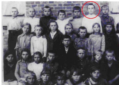
4th grade, 1945