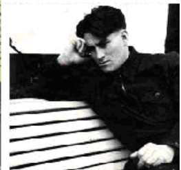
1956. The author of this textbook on a bench on Vasilievsky Island near Leningrad State University.